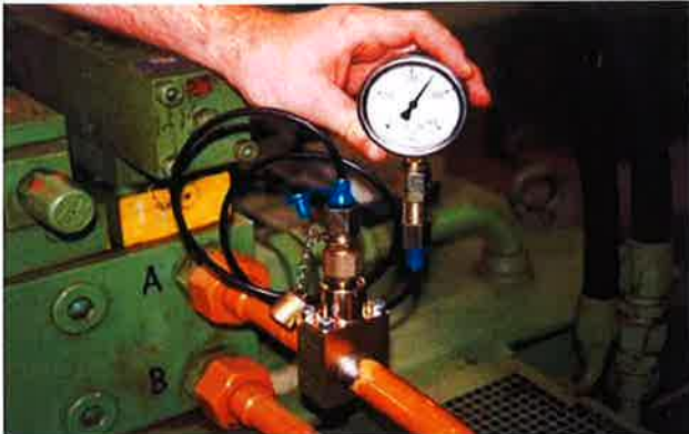
Installation on pressurized pipe serv-Clip ® 1